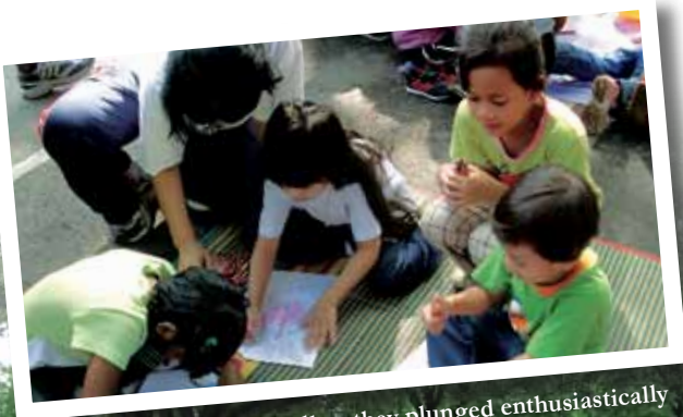
The kids gave it their all as they plunged enthusiastically into the colouring contest.