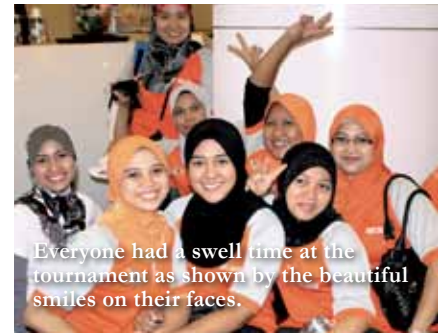
Everyone had a swell time at the tournament as shown by the beautiful smiles on their faces.