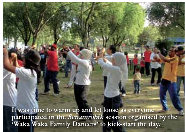
It was time to warm up and let loose as everyone participated in the Senamrobik session organised by the 'Waka Waka Family Dancers' to kick-start the day.