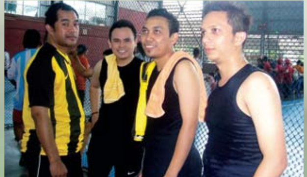
Champs in the Men's Category 'Hujan Rebas', stand tired but triumphant after the thrilling tournament.

Well done everyone for giving it your best shot!