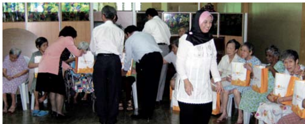
Staff of Uni.Asia General made time to mingle with and hand out gifts to the residents of Asrama Cahaya .

The visit to the old folks home was part of Uni.Asia General's Corporate Social Responsibility efforts to give back to society, in particular the poor and underprivileged.