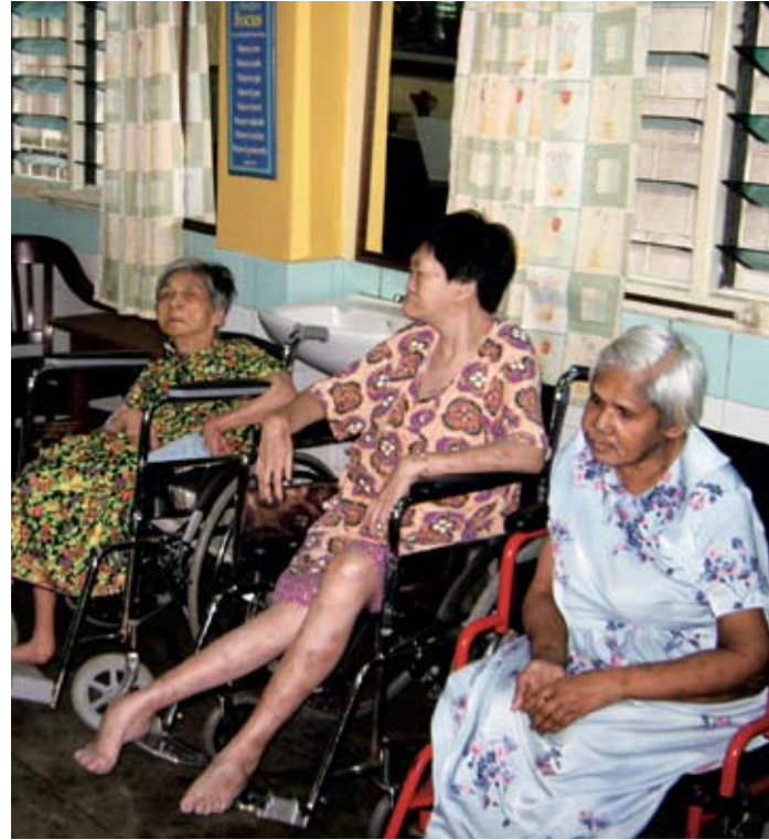
Some of the residents of Asrama Cahaya in Bukit Nanas.

The visit to the old folks home was part of Uni.Asia General's Corporate Social Responsibility efforts to give back to society, in particular the poor and underprivileged.