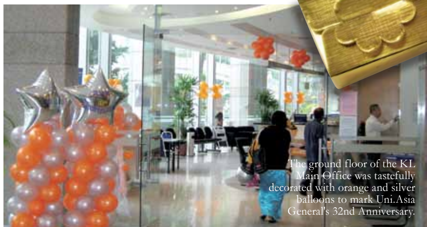
The ground floor of the KL Main Office was tastefully decorated with orange and silver balloons to mark Uni.Asia General's 32nd Anniversary.

Employees of the KL Main Branch transformed the ground floor of the building into a festive area with anniversary decorations.