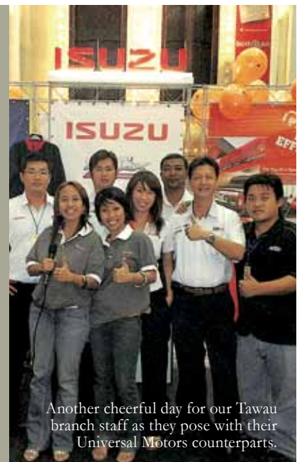
Another cheerful day for our Tawau branch staff as they pose with their Universal Motors counterparts.