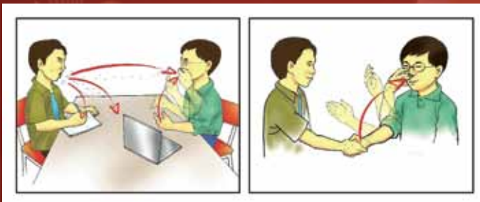
Droplets travel short distances, usually less than one meter.

When infected people cough or sneeze, tiny infected droplets get on hands, surfaces or are dispersed into the air. An uninfected person can breathe in this contaminated air or touch infected hands or surfaces and thus face exposure themselves.