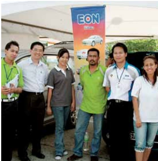
Our support towards EON Berhad has created a win-win situation between the two organisations.