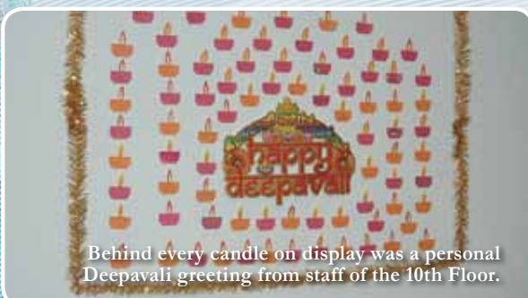
Behind every candle on display was a personal Deepavali greeting from staff of the 10th Floor.