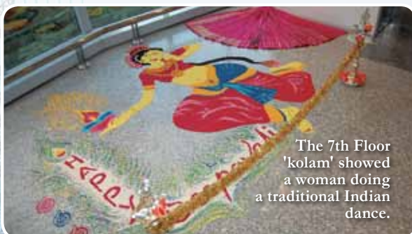
The 7th Floor 'kolam' showed a woman doing a traditional Indian dance.