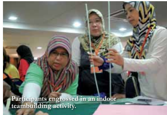
Participants engrossed in an indoor teambuilding activity.