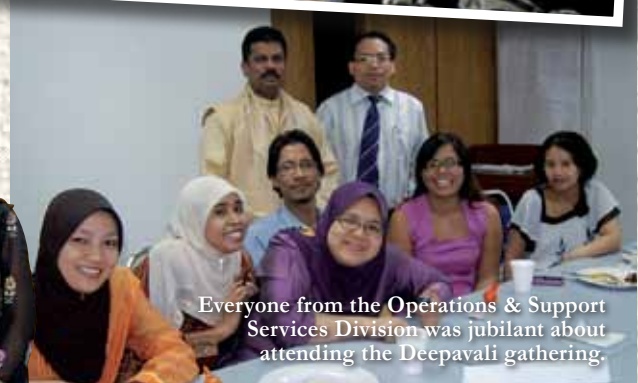
Everyone from the Operations & Support Services Division was jubilant about attending the Deepavali gathering.