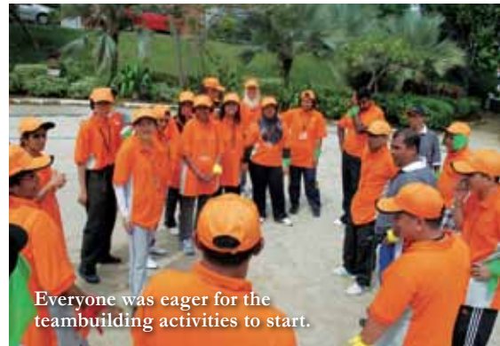
Everyone was eager for the teambuilding activities to start.

The MMIP Recognition and Teambuilding Programme was a great success with everybody heading back to their respective branches in better spirits and making a clear resolve to commit to greater teamwork and enhanced efficiency back at the office.