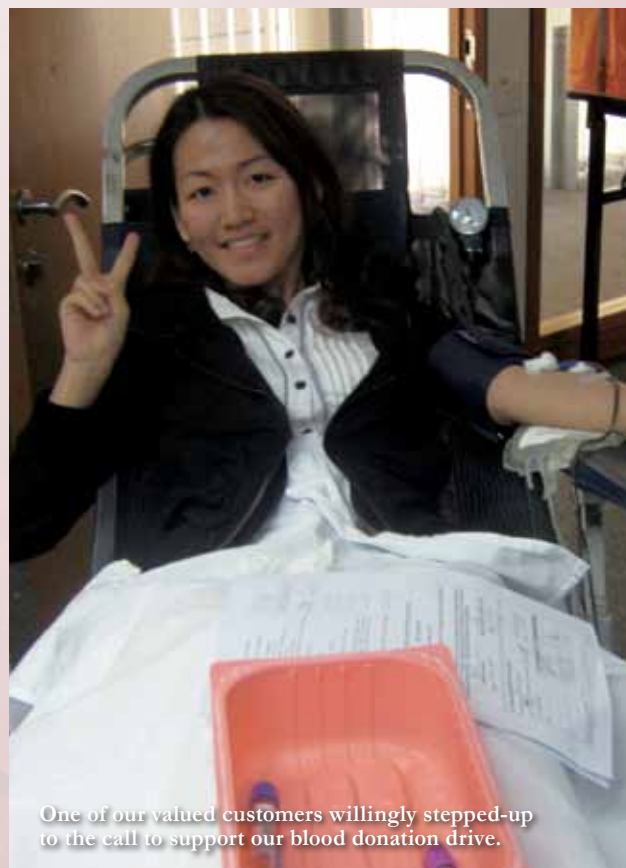
One of our valued customers willingly stepped-up to the call to support our blood donation drive.

We would like to thank everyone for giving so generously as your 'Gift of Life' will save many lives in hospitals across the country.