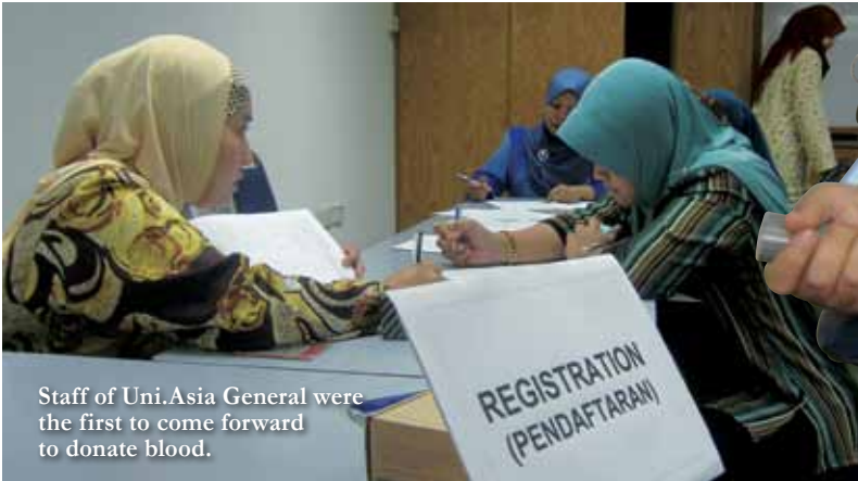
Staff of Uni.Asia General were the first to come forward to donate blood.