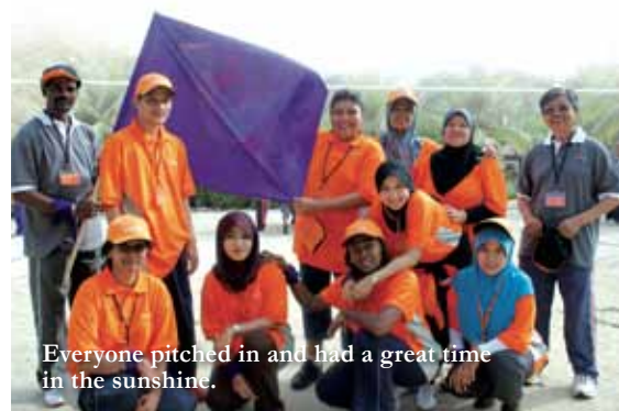
Everyone pitched in and had a great time in the sunshine.