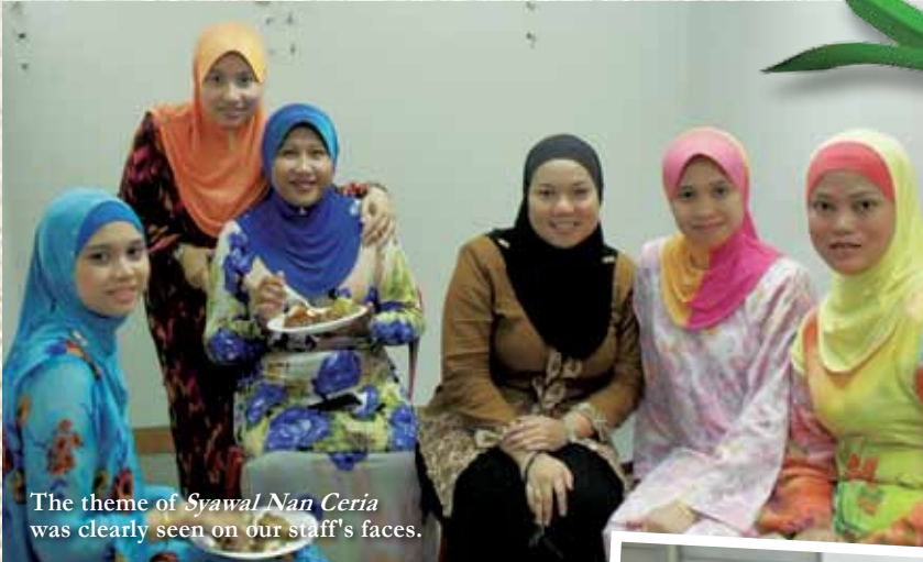
The theme of Syawal Nan Ceria was clearly seen on our staff's faces.

Both gatherings were great opportunities for everyone to mingle with one another.