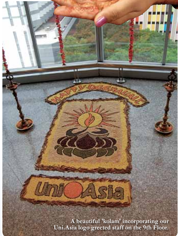
A beautiful 'kolam' incorporating our Uni.Asia logo greeted staff on the 9th Floor.