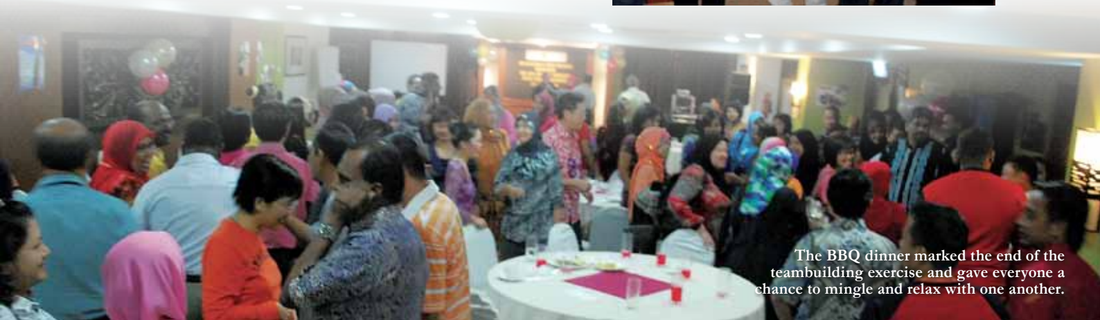
The BBQ dinner marked the end of the teambuilding exercise and gave everyone a chance to mingle and relax with one another.