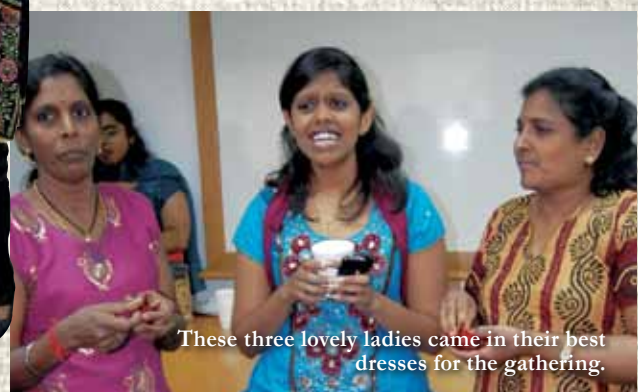
These three lovely ladies came in their best dresses for the gathering.