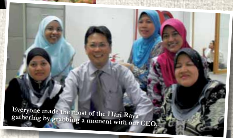
Everyone made the most of the Hari Raya gathering by grabbing a moment with our CEO.

Both gatherings were great opportunities for everyone to mingle with one another after a hard day's work as they celebrated the festivities in the true spirit of 1Malaysia.