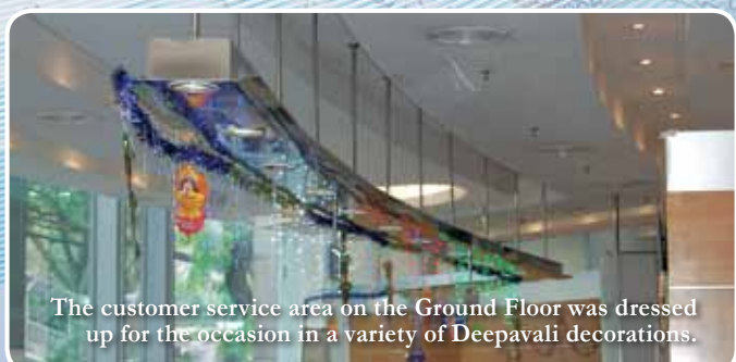
The customer service area on the Ground Floor was dressed up for the occasion in a variety of Deepavali decorations.