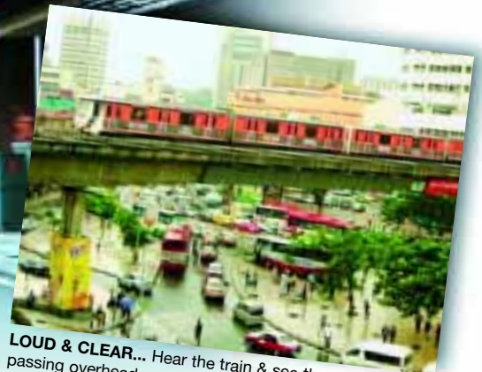
LOUD & CLEAR... Hear the train & see the orange dots passing overhead on STAR-LRT coaches as part of Uni.Asia General's advertising campaign.