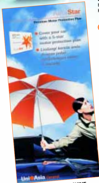
PROTECTION RAIN OR SHINE... All AutoStar cardholders are now also MASA members who enjoy free towing & roadside repairs.