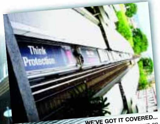
WE'VE GOT IT COVERED... The branding even appears on the top portion of the STAR-LRT coaches for better visibility.