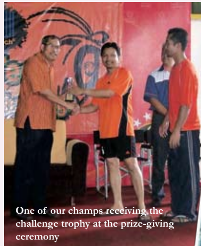
One of our champs receiving the challenge trophy at the prize-giving ceremony

Exhausted but totally satisfied with their resounding victory... well done, guys >>