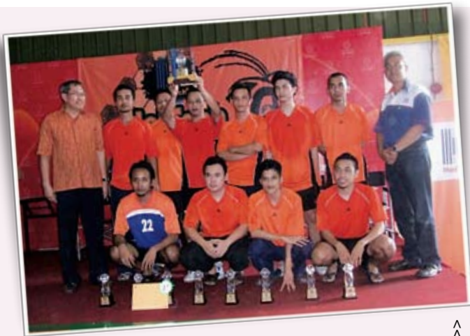
Our boys group for a shot with the coveted challenge trophy... you're the best!