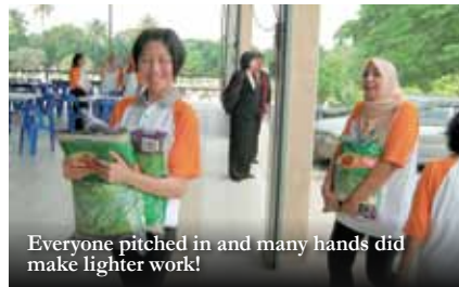
Everyone pitched in and many hands did make lighter work!