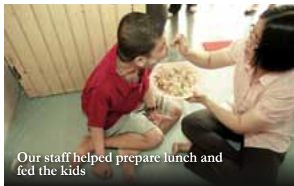
Our staff helped prepare lunch and fed the kids