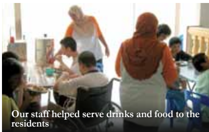
Our staff helped serve drinks and food to the residents