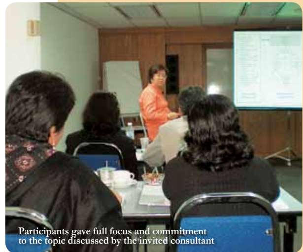
Participants gave full focus and commitment to the topic discussed by the invited consultant

The feedback received from participants has been very positive. Most of them found the workshop and training to be relevant and beneficial to their day-to-day work. More thought-provoking workshops and training courses are slated for the coming months.