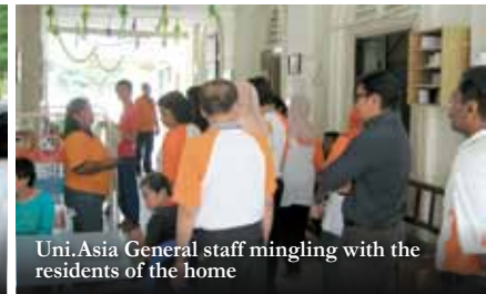
Uni.Asia General staff mingling with the residents of the home