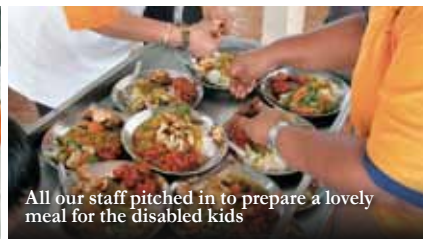
All our staff pitched in to prepare a lovely meal for the disabled kids