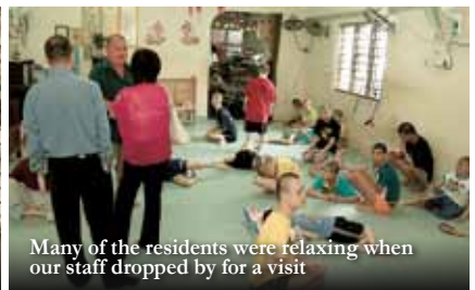
Many of the residents were relaxing when our staff dropped by for a visit