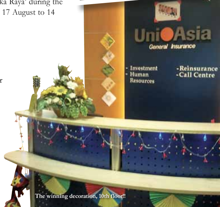
The winning decoration, 10th floor!!