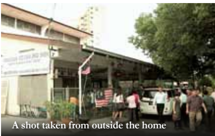
A shot taken from outside the home

While it was heartbreaking to see their disabilities, we were comforted by their warm smiles and genuine happiness.