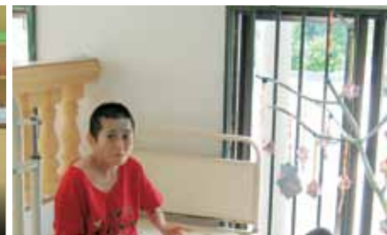
Two of the residents seen here in their rooms