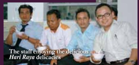
The staff enjoying the delicious Hari Raya delicacies