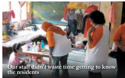
Our staff didn't waste time getting to know the residents