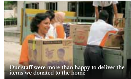
Our staff were more than happy to deliver the items we donated to the home

Besides mingling with the kids and sharing a meal with them, a cash donation of RM3,000 was made for the running of the home.