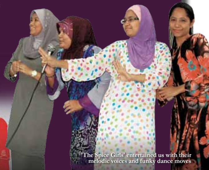
'The Spice Girls' entertained us with their melodic voices and funky dance moves