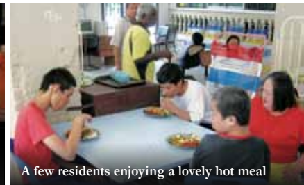
A few residents enjoying a lovely hot meal