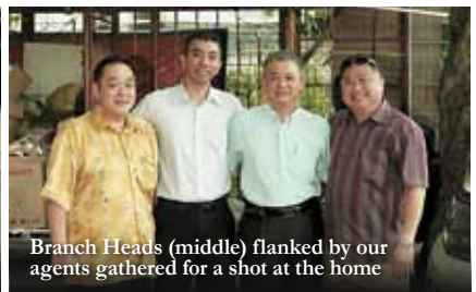
Branch Heads (middle) flanked by our agents gathered for a shot at the home