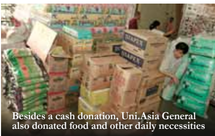
Besides a cash donation, Uni.Asia General also donated food and other daily necessities