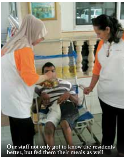
Our staff not only got to know the residents better, but fed them their meals as well