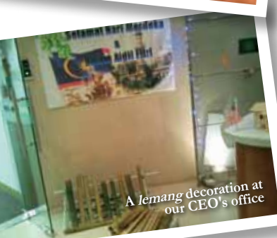
A Lemang decoration at our CEO's office