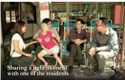
Sharing a light moment with one of the residents