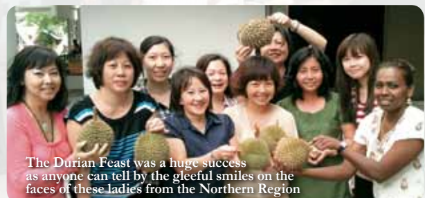
The Durian Feast was a huge success as anyone can tell by the gleeful smiles on the faces of these ladies from the Northern Region