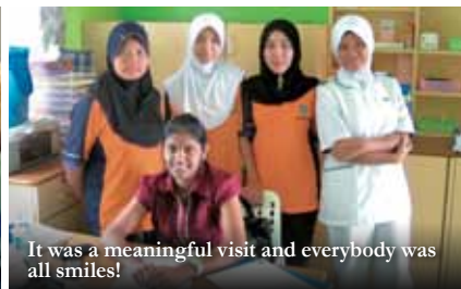
It was a meaningful visit and everybody was all smiles!