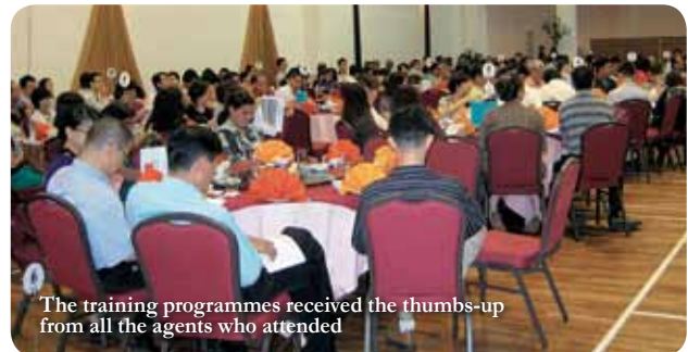
The training programmes received the thumbs-up from all the agents who attended

Armed with information derived from these courses, our agents and staff are now more well-versed with the facts surrounding these products and can promote its features and benefits with more confidence and ease.