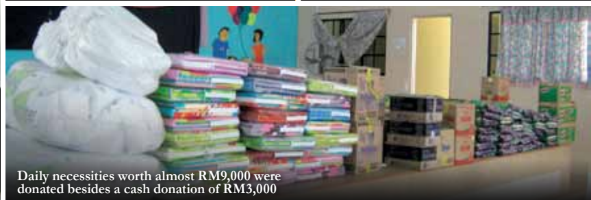
Daily necessities worth almost RM9,000 were donated besides a cash donation of RM3,000