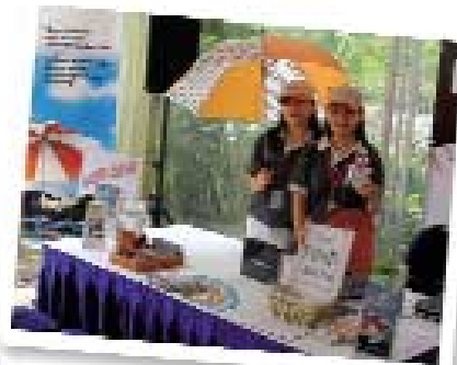
PRETTY LASSES... Our Uni.Asia staff doing their bit to promote the company at the roadshow.