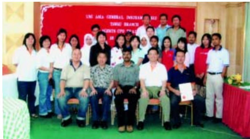
READY FOR ACTION!... Participating agents gained much knowledge from the Agent's Continuous Professional Development session.

being planned that will cover product knowledge and other on-the-job technicalities such as claims processing and underwriting skills. The programmes are to be held every two months.